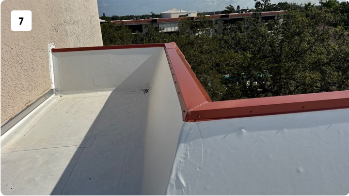
Roof level Images

Project: Gulf Front Lagoon Bldg 2 Creator: FLRCIS LLC