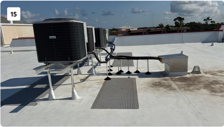
Roof level Images

Project: Gulf Front Lagoon Bldg 2 Creator: FLRCIS LLC