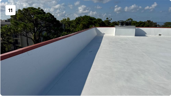
Roof level Images

Project: Gulf Front Lagoon Bldg 2 Creator: FLRCIS LLC