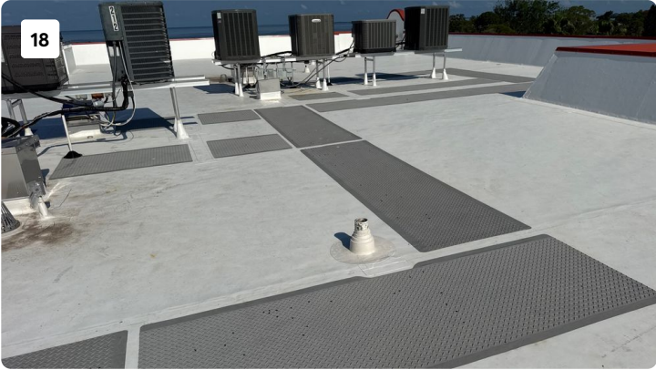
Roof level Images

Project: Gulf Front Lagoon Bldg 2 Creator: FLRCIS LLC