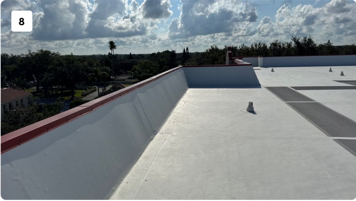
Roof level Images

Project: Gulf Front Lagoon Bldg 2 Creator: FLRCIS LLC