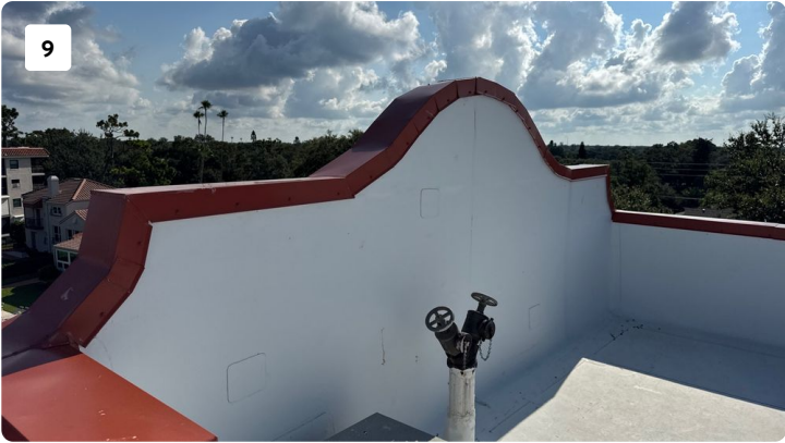
Roof level Images

Project: Gulf Front Lagoon Bldg 2 Creator: FLRCIS LLC