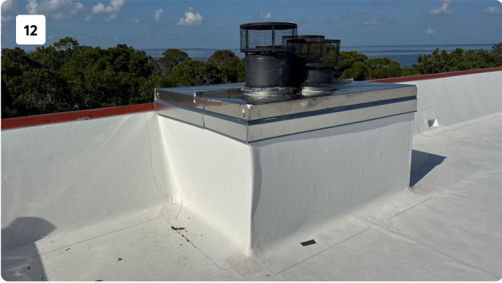
Roof level Images

Project: Gulf Front Lagoon Bldg 2 Creator: FLRCIS LLC