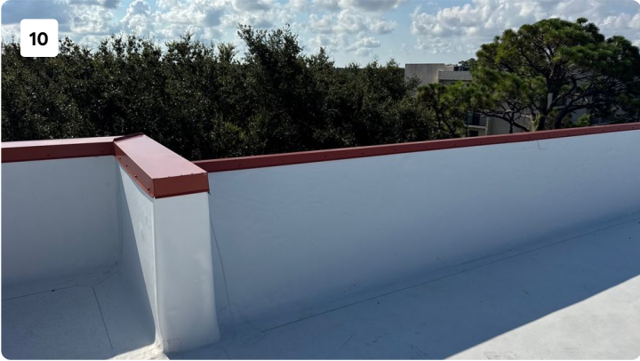
Roof level Images

Project: Gulf Front Lagoon Bldg 2 Creator: FLRCIS LLC