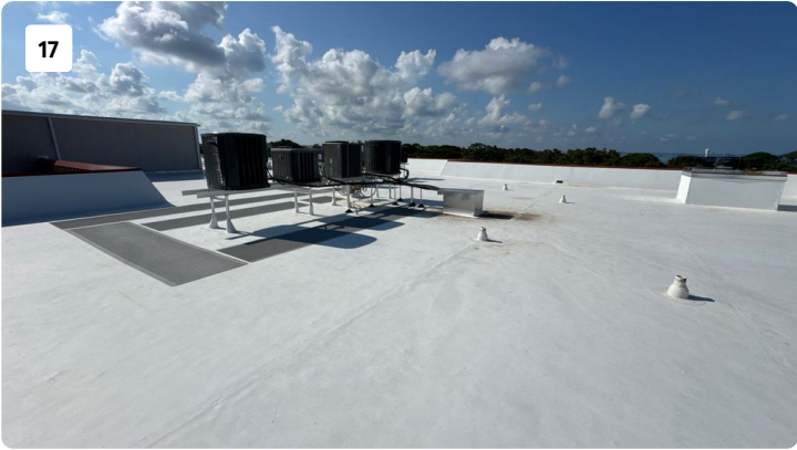
Roof level Images

Project: Gulf Front Lagoon Bldg 2 Creator: FLRCIS LLC