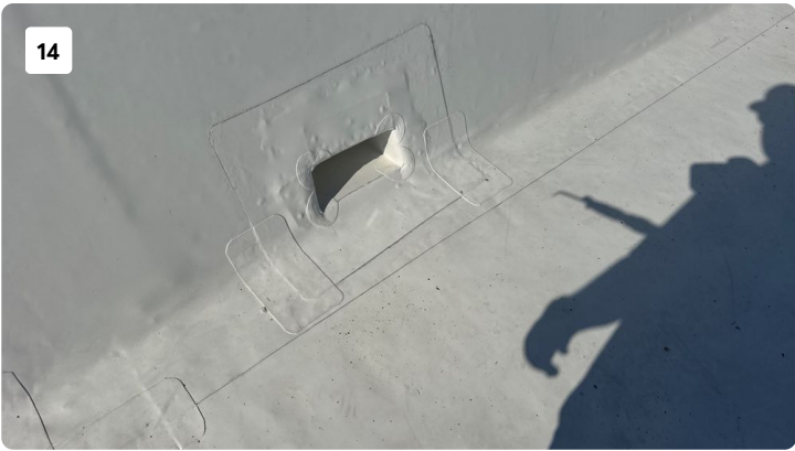
Roof level Images

Project: Gulf Front Lagoon Bldg 2 Creator: FLRCIS LLC