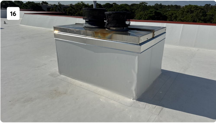
Roof level Images

Project: Gulf Front Lagoon Bldg 2 Creator: FLRCIS LLC